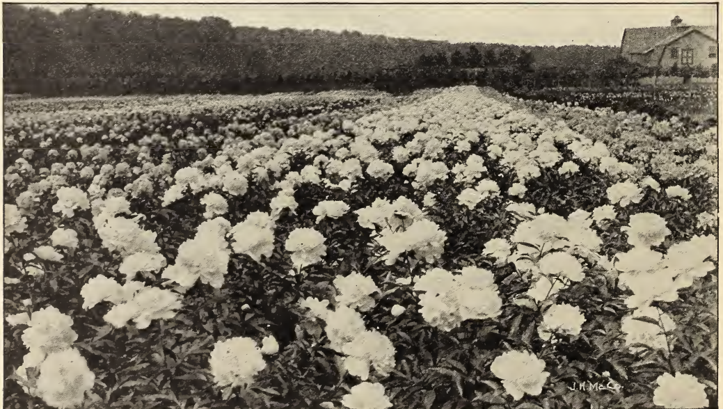
Peonies. Did you ever see better ones?